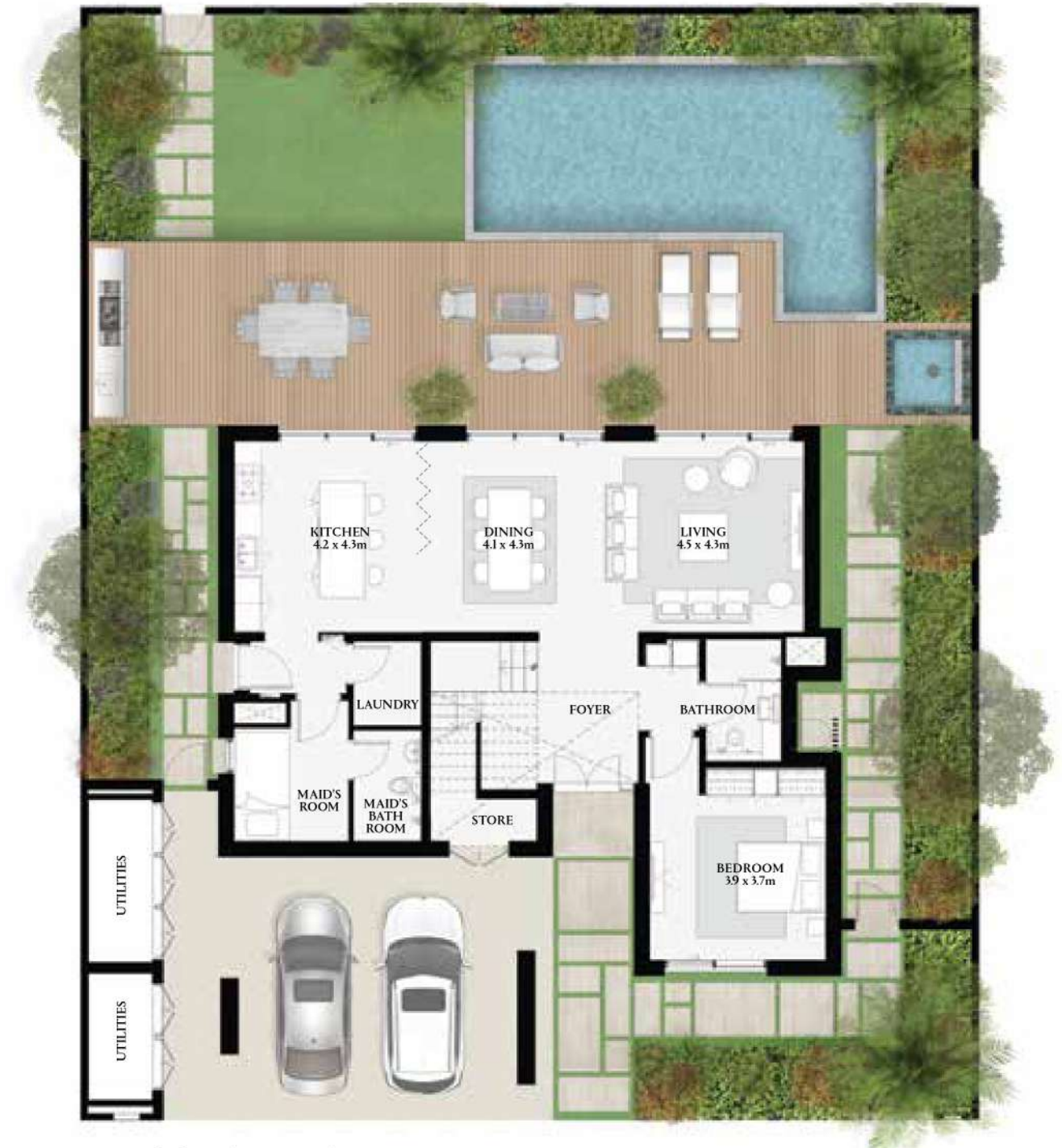
Ground Floor (Option 2)