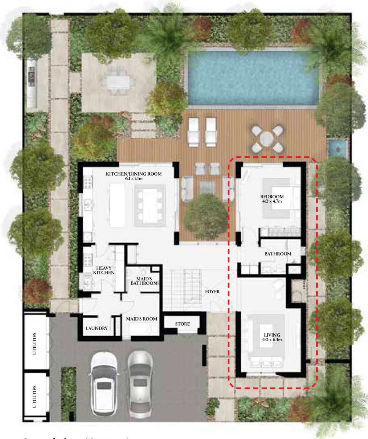
Ground Floor (Option 3)