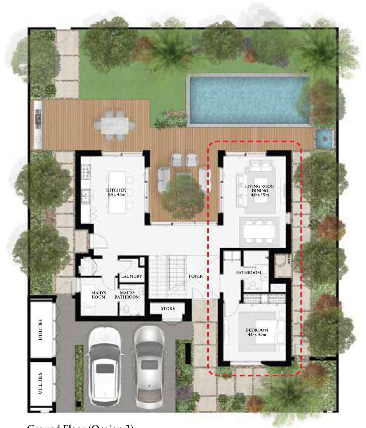
Ground Floor (Option 2)