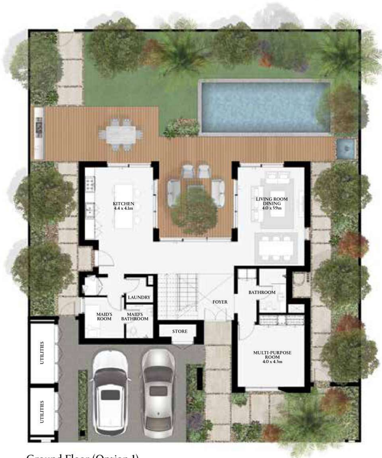
Ground Floor (Option 1)