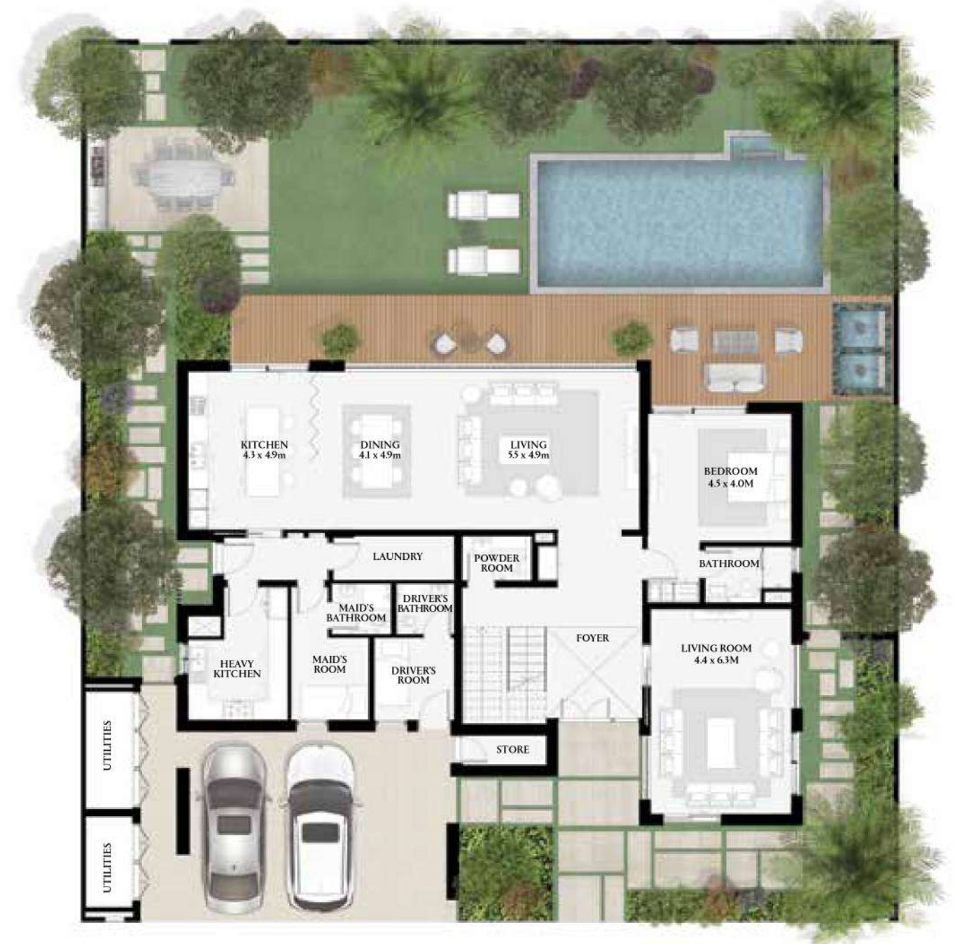
Ground Floor (Option 2)