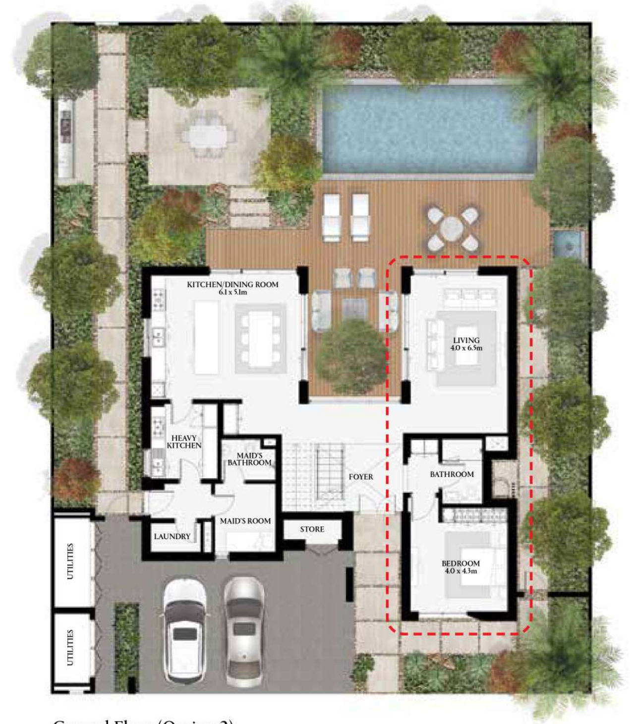
Ground Floor (Option 2)