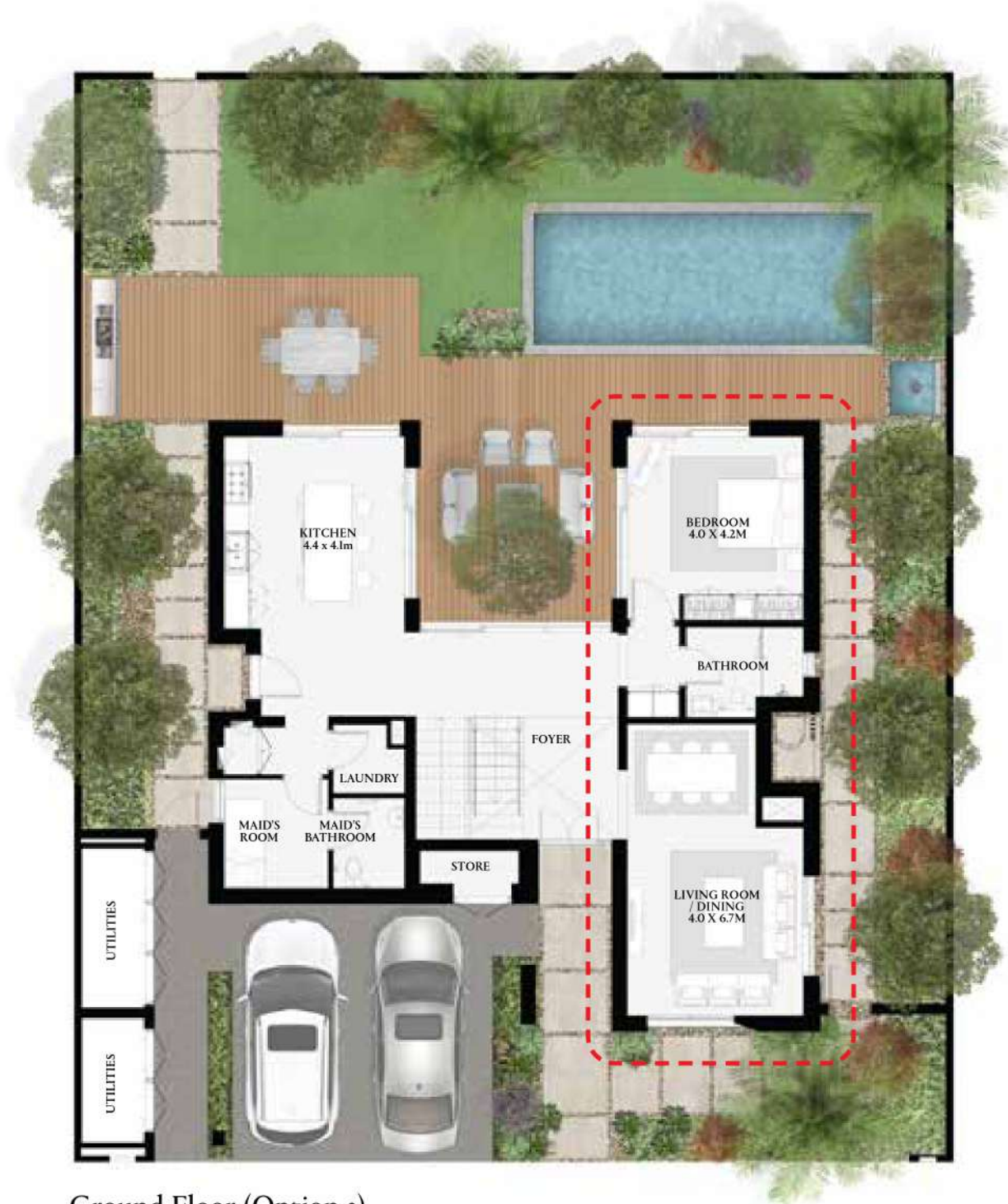
Ground Floor (Option 3)