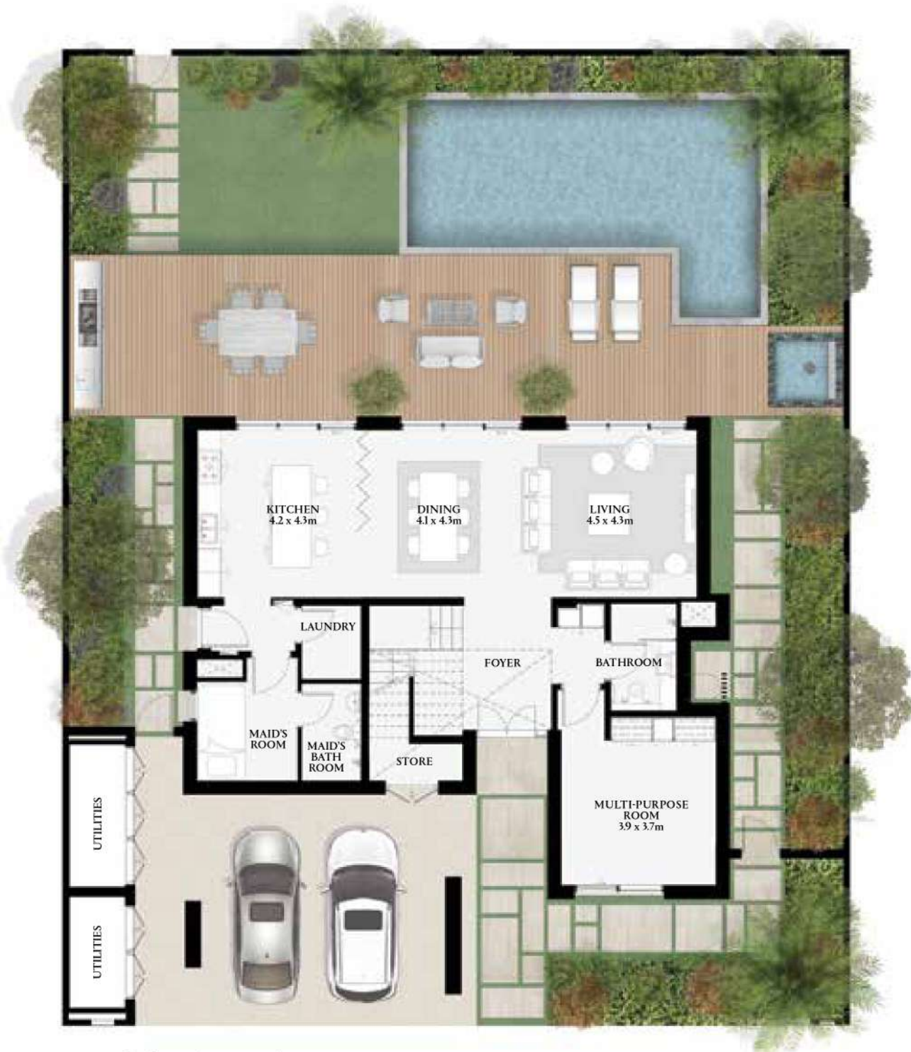
Ground Floor (Option 1)